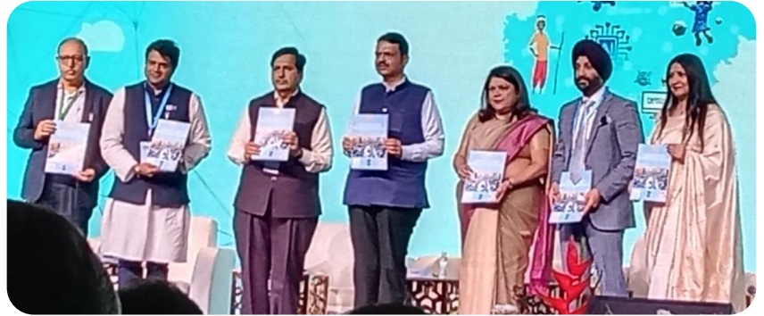
Release of State Innovation Policy Document