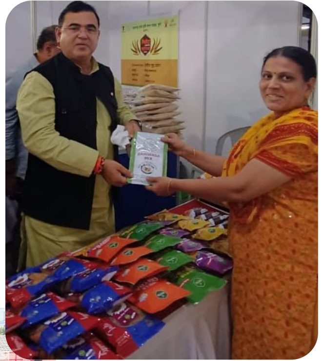
Mr. Jaykumar Rawal - Hon'ble Minister of Marketing and Protocol, Maharashtra State