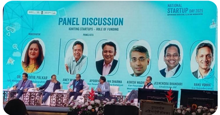
Key Note and Pannel Discussions

We were honored to be invited to the National Startup Day celebration in Mumbai. It was a wonderful experience to listen to experts discuss various trending issues and gain valuable business insights from industry stalwarts.